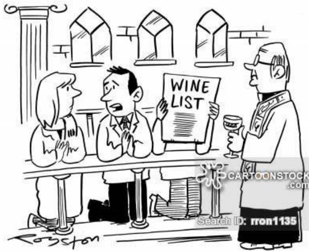
"It's an innovative way to boost attendance."